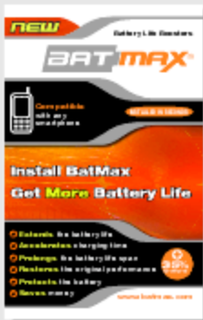
BatMax / Smartphone 56.75 X 35 mm Model #: BA/S-01 UPC: 185967000031