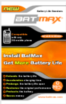
BatMax / 3G Mobile Phone 45 X 25 mm Model #: BA/M-03 UPC: 185967000024