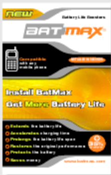
BatMax / Mobile Phone 45 X 25 mm Model #: BA/M-01 UPC: 185967000017