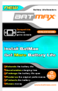
BatMax / Game Console 52.5 X 32.5 mm Model #: BA/G-01 UPC: 185967000062