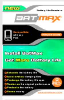
BatMax / PDA 78.75 X 56.75 mm Model #: BA/P-01 UPC: 185967000055