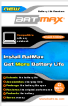
BatMax / Notebook 113.5 X 78.75 mm Model #: BA/N-01 UPC: 185967000048