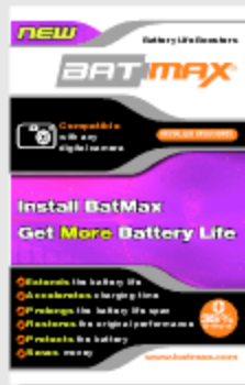
BatMax / Digital Camera 35 X 32.5 mm Model #: BA/C-01 UPC: 185967000086