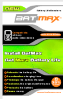
BatMax / Audio-Video 56.75 X 35 mm Model #: BA/A-01 UPC: 185967000109

BatMax is individually packaged in a convenient and compact sealed clamshell that contains a tri-folded insert card with a 3 languages installation manual (English / Spanish / French) (US domestic packaging).